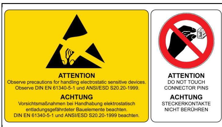
4 - ESD Hinweise / ESD Notes